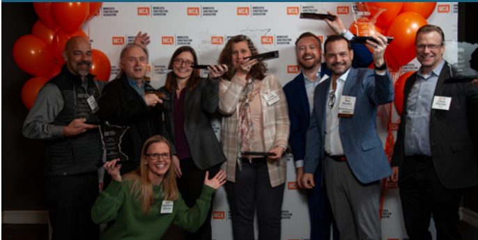
NEW PROJECT TOTAL VALUE UNDER $15 MILLION Terra Construction — Carleton College Class of 1974 Center