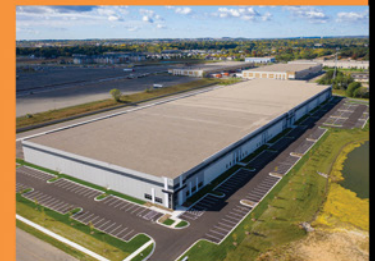
Canterbury Business Park