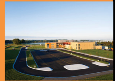
White Bear Lake Elementary

Your Full-Service Asphalt Pavement Solutions Provider Parking Lots | Roadways | Trails | Athletic Surfaces bitroads.com | 651-686-7001