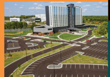
Omni Vikings Lakes Hotel