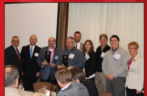
MCA Choice Award Duluth International Airport's New Passenger Terminal Kraus-Anderson Construction Company