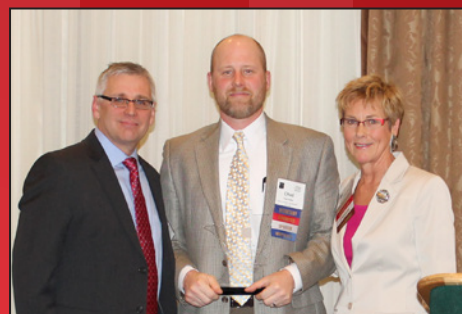
Renovation, Expansion, or Tenant Improvement Project Longfellow Elementary School Addition and Renovation Kraus-Anderson Construction Company