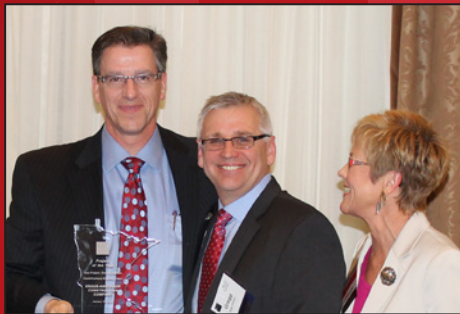
New Construction Total Value Over $10 Million or Subcontractor Value Under $1 Million HealthPartners RiverWay Clinic Kraus-Anderson Construction Company