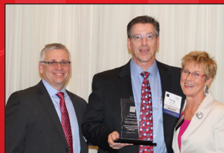
Green Or Sustainable Project Gundersen Health Inpatient Behavioral Health Building Kraus-Anderson Construction Company