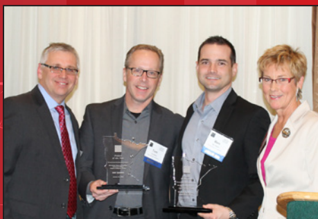
Government Construction Project Minnesota West Community & Techni- cal College – Health & Wellness Center Terra General Contractors