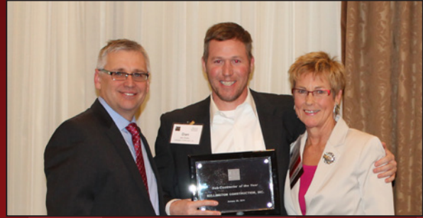
Sub-Contractor of the Year Kellington Construction