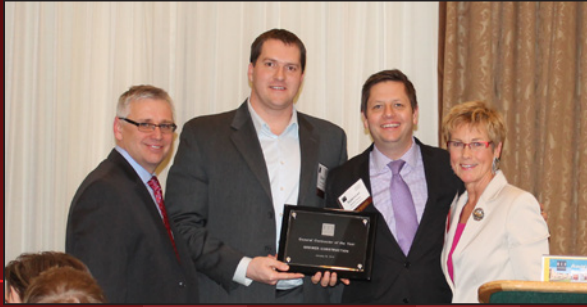
General Contractor of the Year Greiner Construction